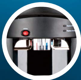
Concealed Water Outlet