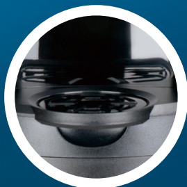
Removable Drip Tray