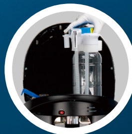
Replaceable Reservoir System SmartFlo™ Water Cartridge