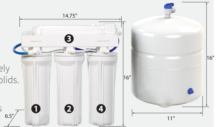
May not look exactly as shown